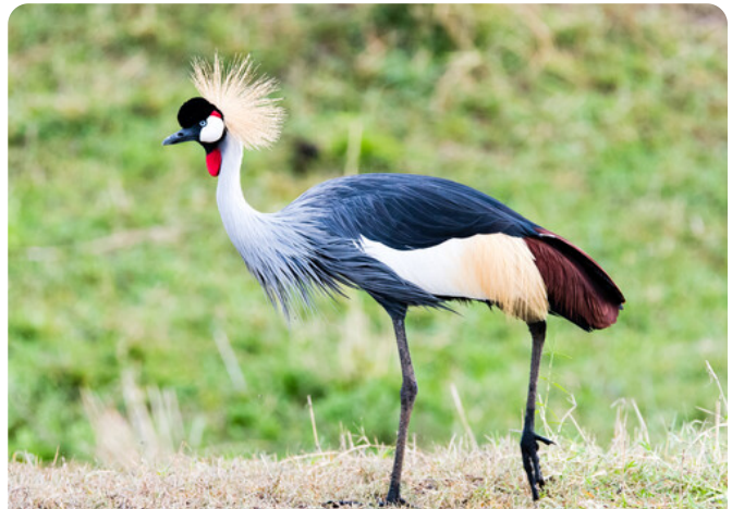
Serengeti National Park