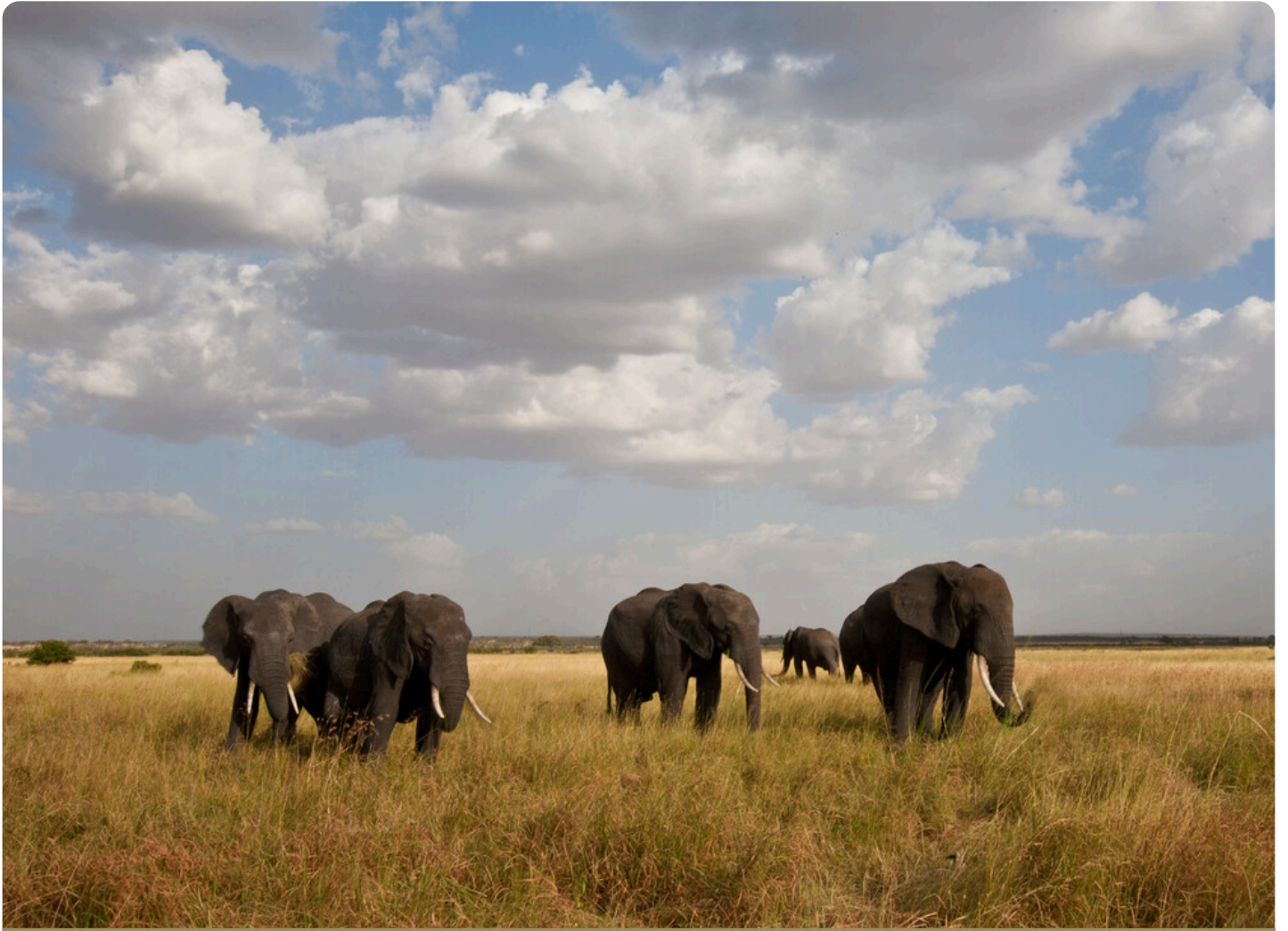
Serengeti National Park