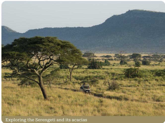
Exploring the Serengeti and its acacias