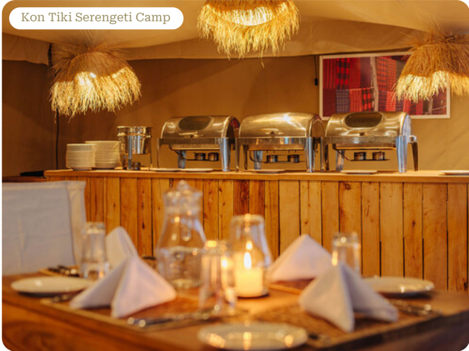
Kon Tiki Serengeti Camp

Extend your stay at Kon Tiki Serengeti Camp for another night.